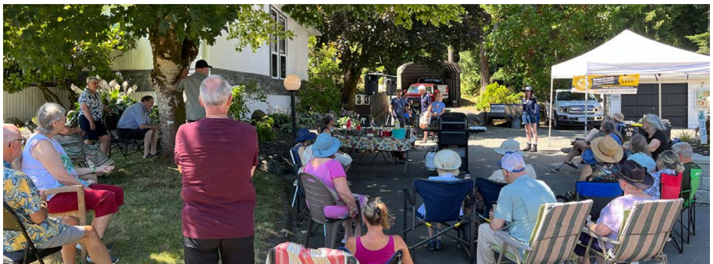
Image: Springwood Park residents enjoy a celebratory BBQ for achieving FireSmart Neighbourhood Recognition.

It takes a community to defend against wildfire and working together realizes more effective results. Recognition is renewed annually through ongoing mitigation projects such as hedge pruning and enhanced home construction.