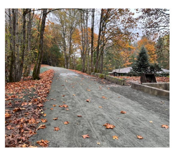
CVT-Agira Road repaired and reopened November 2024