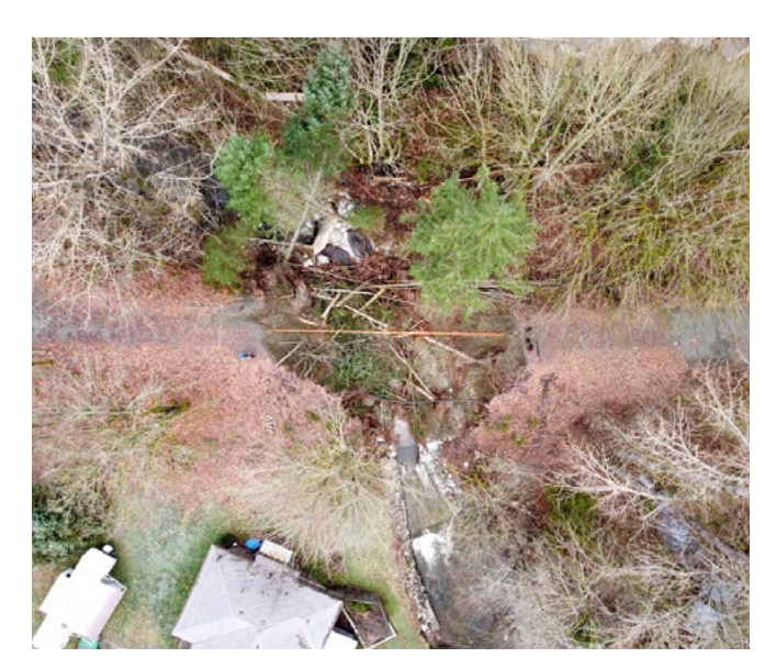
CVT-Agira Road washout from November 2021